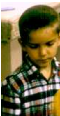
Dusty around, say, 1994